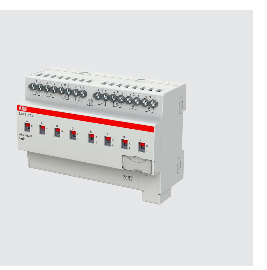
ABB i-bus® KNX SA/S 8.16.2.2 Switch Actuator